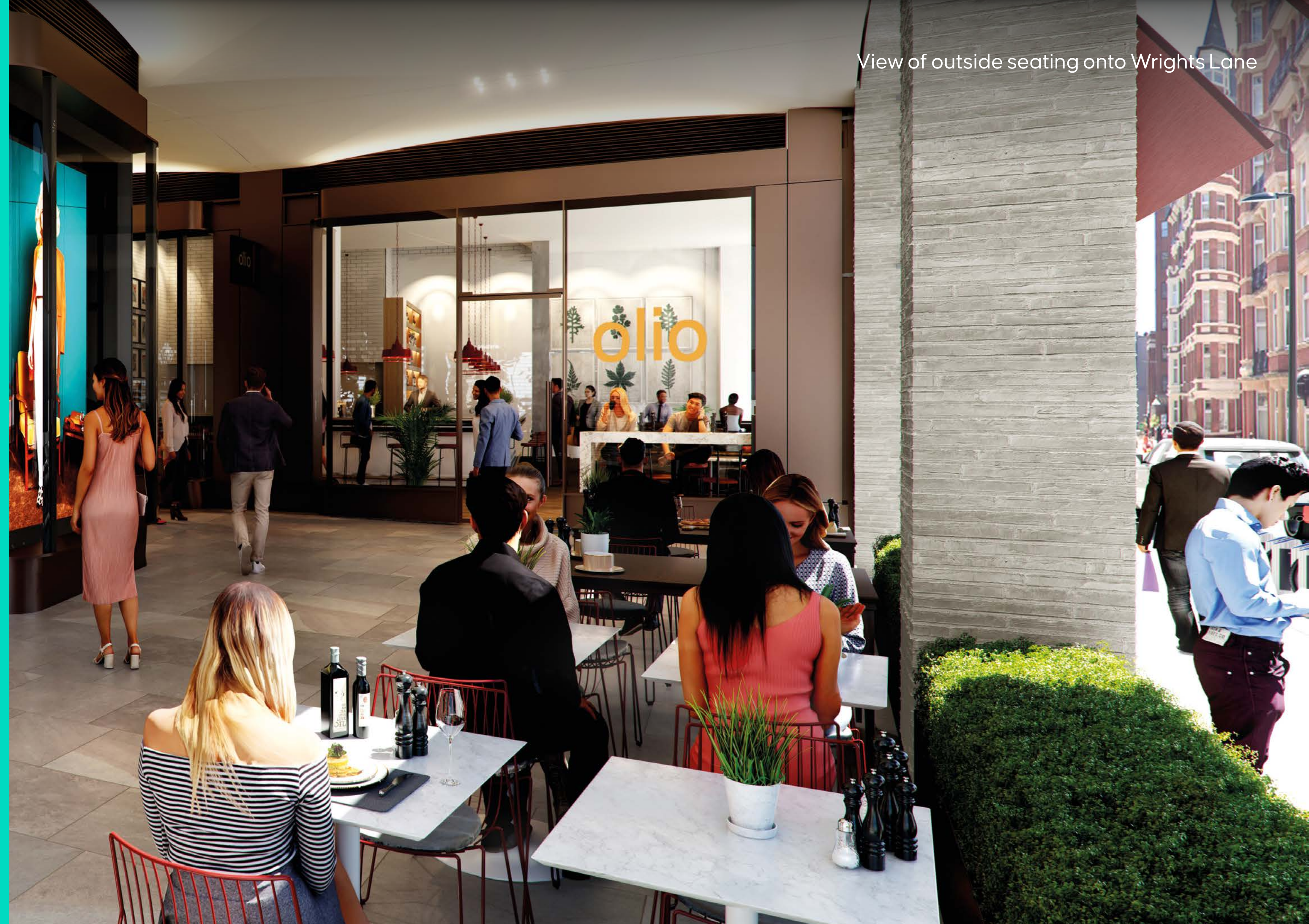
View of outside seating onto Wrights Lane

The restaurant benefits from direct access from High Street Kensington tube station and is adjacent to 95,000 sq ft of new office space. Wrights Lane has high footfall whilst offering the opportunity for an intimate dining experience.