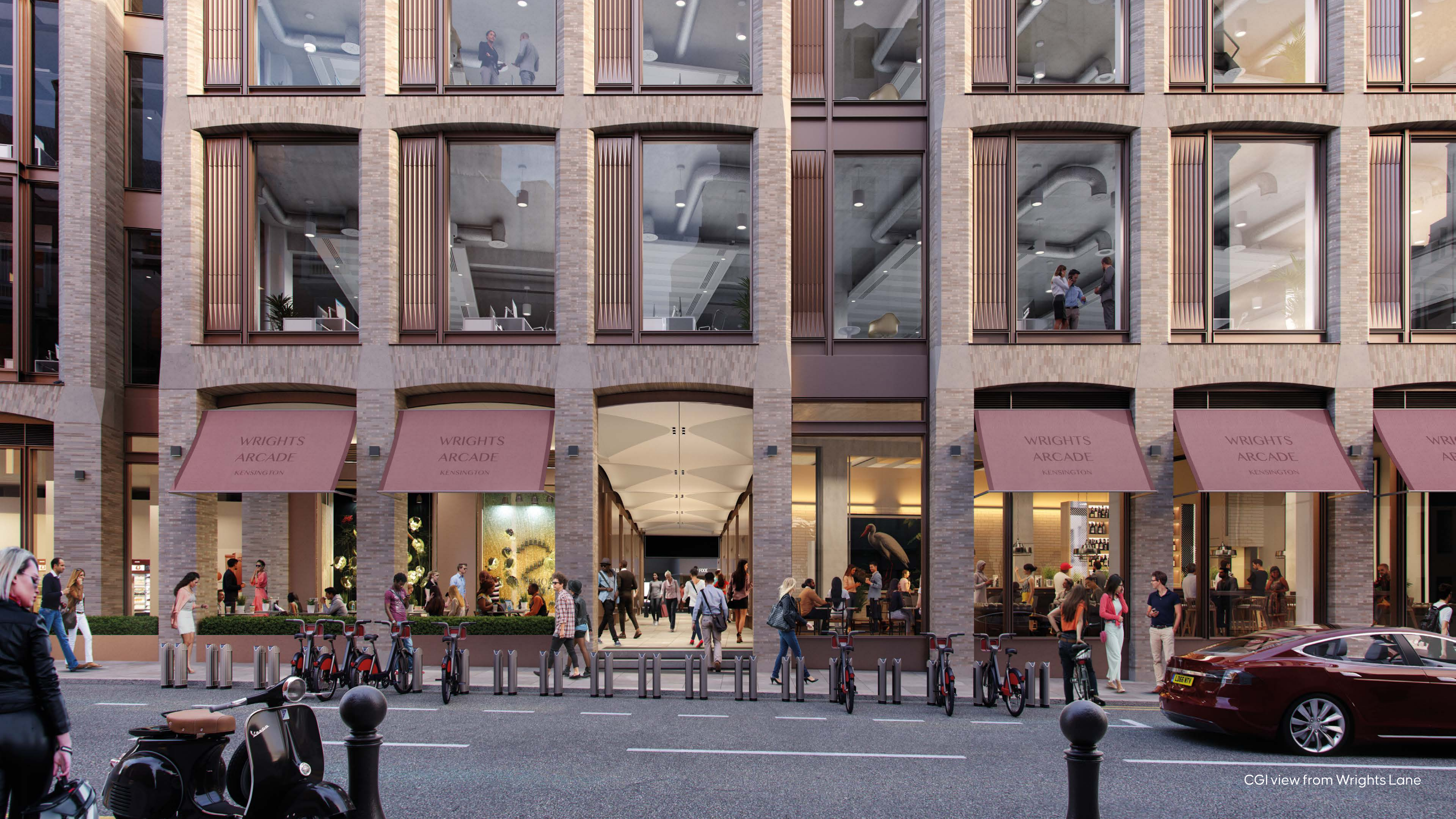
CGI view from Wrights Lane